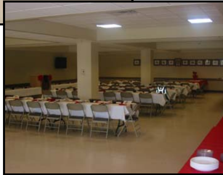
Indiana Fire Association Social Hall